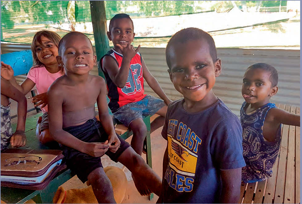
Above: One Arm Point kids at Bardi Christian Fellowship Church, WA.