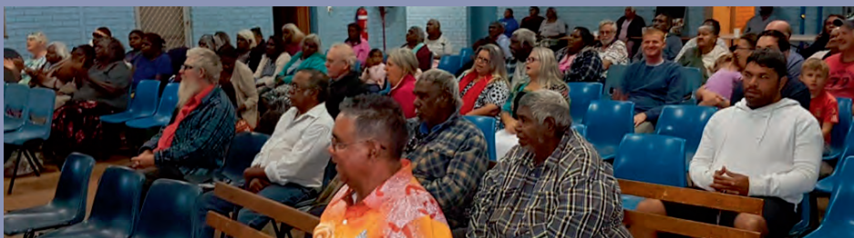
Above: KCF Convention, Kununurra, WA